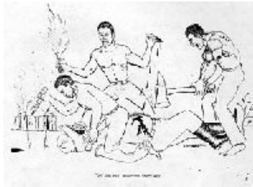
Click for full size picture. (12K)